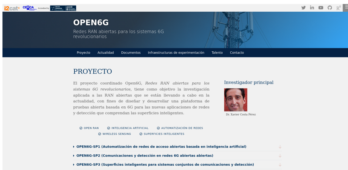
Figure 2: Open6G program website.

In order to ensure the sustainability of the project results, the UNICO I+D 6G program web site will be available a minimum of two years after project’s end.