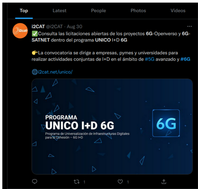
Figure 4: Example of notification through the i2CAT's Twitter account