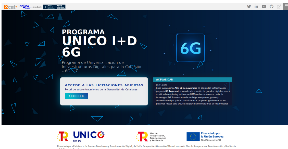
Figure 1: UNICO I+D 6G program website.

The website has been created under the responsive design criteria in order to guarantee the best user experience whether viewed on a desktop or a smartphone. Also, the website has been designed to be compliant with the Visual Identity requirements established by Plan de Recuperación, Transformación y Resiliencia from the Spanish Government, see, https://planderecuperacion.gob.es/identidad-visual , for more details in section 7.3 (Visual Identity).