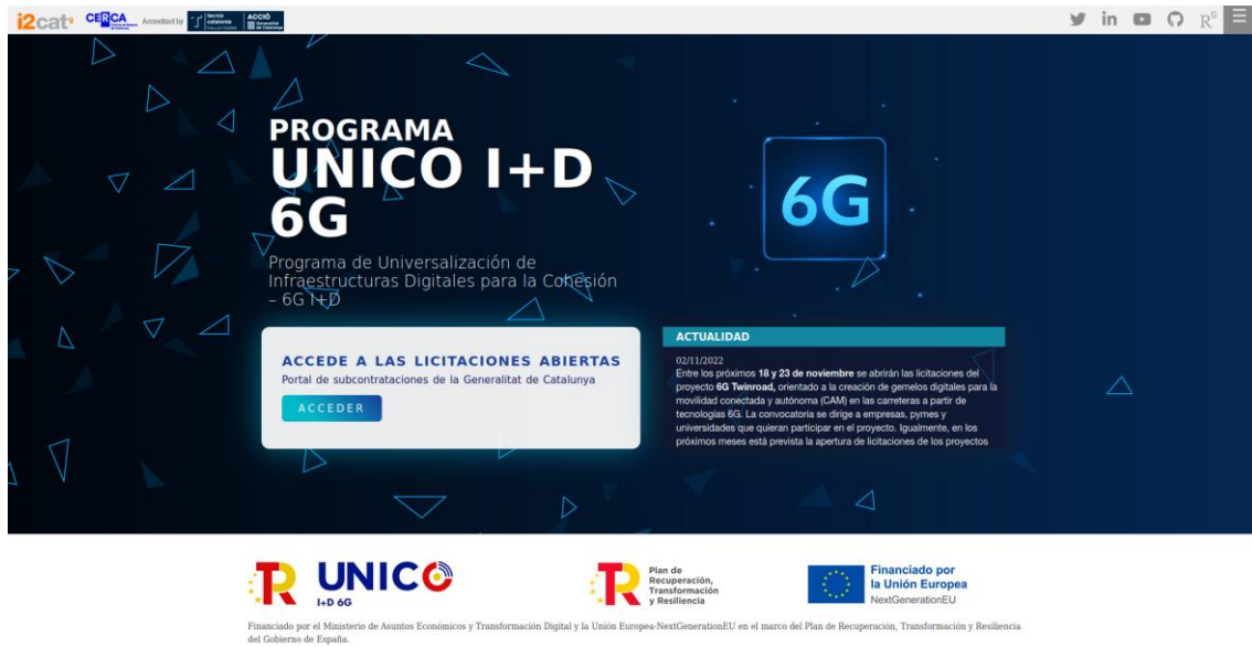
Figure 1: UNICO I+D 6G program website

On this website, a dedicated subsite is integrated for the Open6G project. The subsite offers a general description of the project and its main objectives and a brief reference to the principal investigator. All the information about the project's activities (past, ongoing, upcoming), developments, and results will be accessible from the Open6G subsite. Figure 2 presents the front page of the Open6G I+D 6G program website.