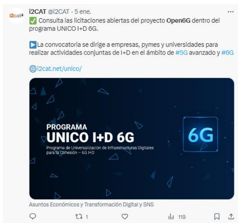
Figure 4: Example of update through the i2CAT's X account

The i2CAT Communications department will closely work with the project's research team to keep track of the project and elaborate press releases when new achievements might be of interest to the media. i2CAT will also mention it in other external campaigns aimed at disseminating the i2CAT's 5G and 6G research strategy.