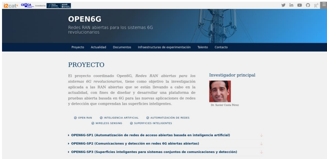
Figure 2: Open6G program website

Open6G will be present in social networks as well. News, events and achievements from the project will also be disseminated through LinkedIn and X (formerly Twitter).