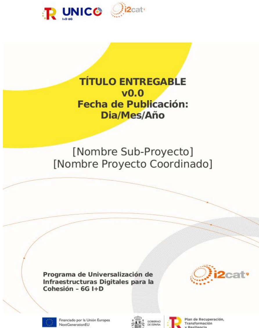
Figure 6: Deliverable document template

Finally, in Figure 7 we show an example of the PowerPoint template to be used in all the dissemination activities provided by i2CAT.