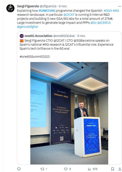
Figure 9: X post on the one6G Summit