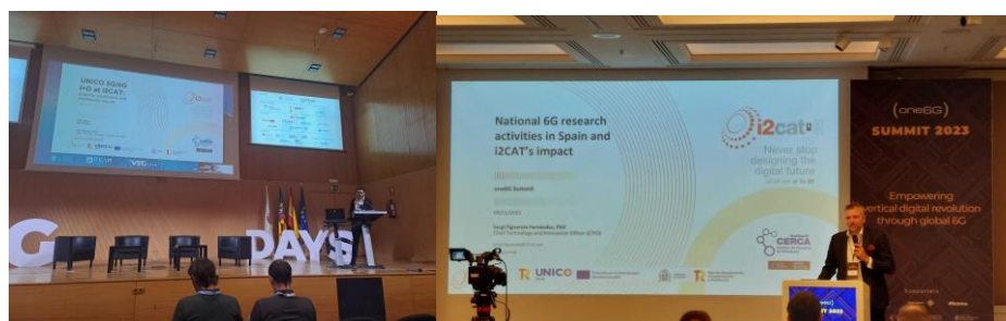
Figure 8: Photos from dissemination events

In Figure 8, we show two pictures of the first two mentioned events.