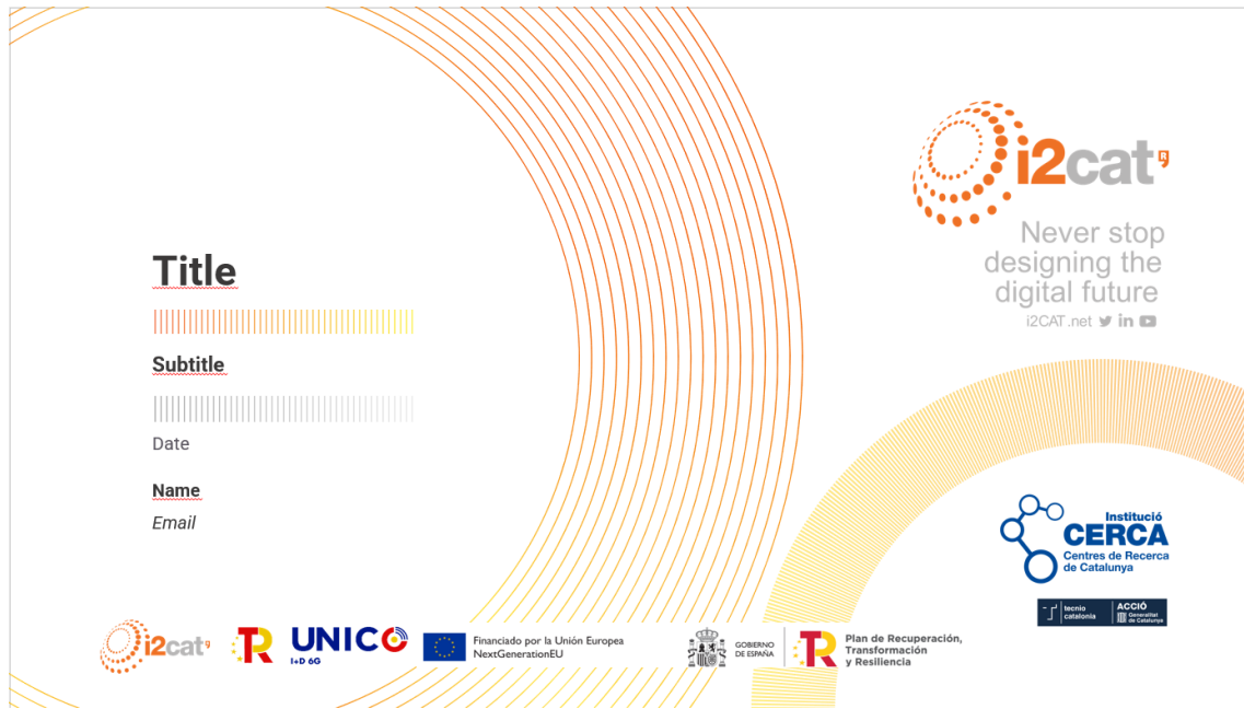
Figure 7: Dissemination powerpoint template